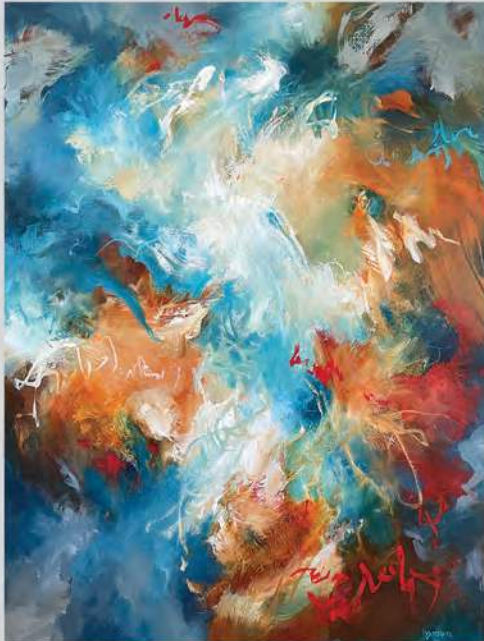
Oceans of Meaning , Acrylic on canvas